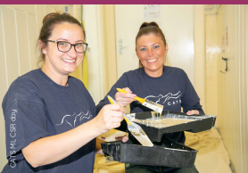
CATs ML C&S day