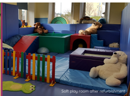
Soft play room after refurbishment