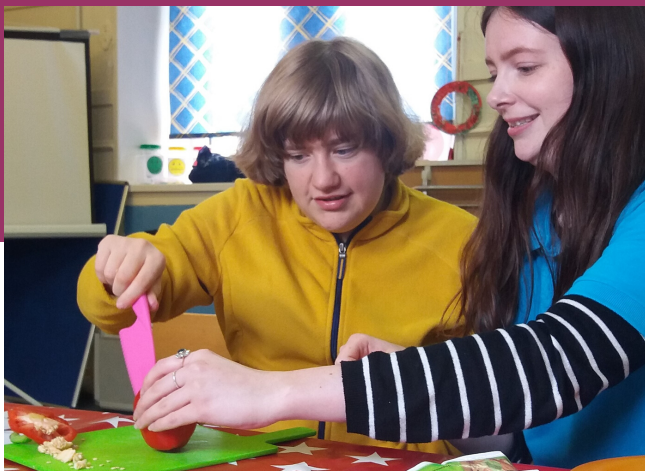
Life skills session

We empower families to address the challenges that complex conditions present by equipping them with practical techniques, knowledge and advice. Our centre offers a safe place to access specialist facilities and support, a place where they belong and can be themselves.