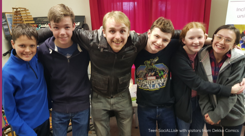
Teen SociALLise with visitors from Dekko Comics

Our services for teenagers (promoting social skills and self esteem whilst providing community experiences) have gone from strength to strength this year.