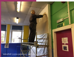
Westhill Lions painting soft play room