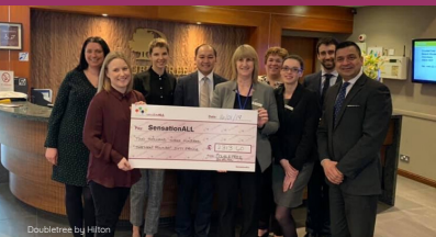
Doubletree by Hilton