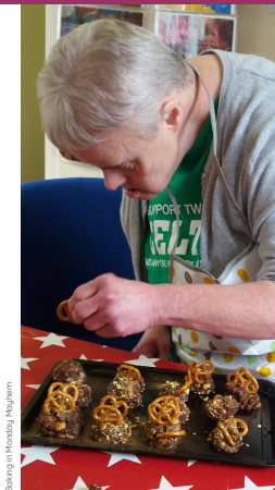
Baking in Monday Mayhem