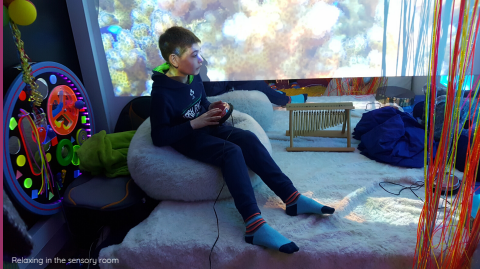
Relaxing in the sensory room